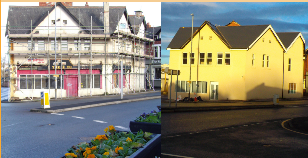
The 3Ts before work commenced