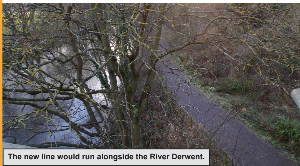
The new line would run alongside the River Derwent.

We can advise you that the application has reached the final national shortlist of 16 schemes and the feasibility study has been granted by the Department of Transport.