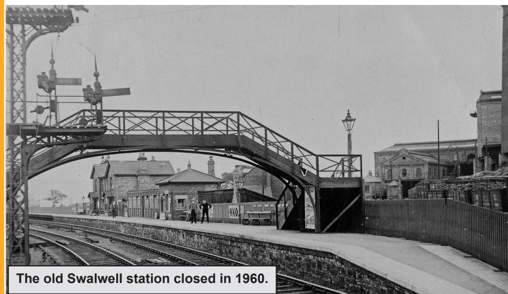
The old Swalwell station closed in 1960.

If the scheme is approved the railway line would branch off the original route and run alongside Swalwell Cricket Club, follow the old railway lines in the former Derwent Haugh Cokeworks, under the road bridge past the Swalwell allotments, along past the Toyota and Mazda garages at the Metro Centre and join the Tyne Valley Railway Line next to where the River Derwent meets the River Tyne.