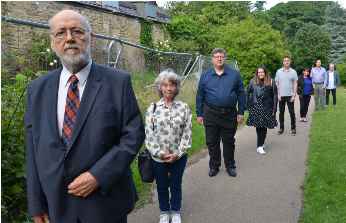
• The 8 Lib Dem Councillors representing Whickham, Swalwell, Sunniside, Marley Hill, Streetgate, Marley Hill, Byermoor, Dunston and Lobley Hill next to the stables in Chase Park which Labour have agreed to sell to a developer.

Labour council sells off part of Chase Park, calling it "brownfield".