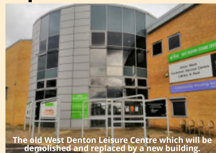
The old West Denton Leisure Centre which will be demolished and replaced by a new building.

While incompetent Labour are planning to close leisure facilities in Gateshead, Labour run Newcastle are planning to open a new, state-of-the-art leisure centre in West Denton, paid for by a £20 million "levelling up" grant from the government.