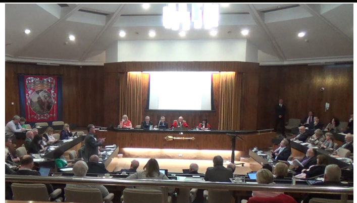
Average numbers of residents per Councillor