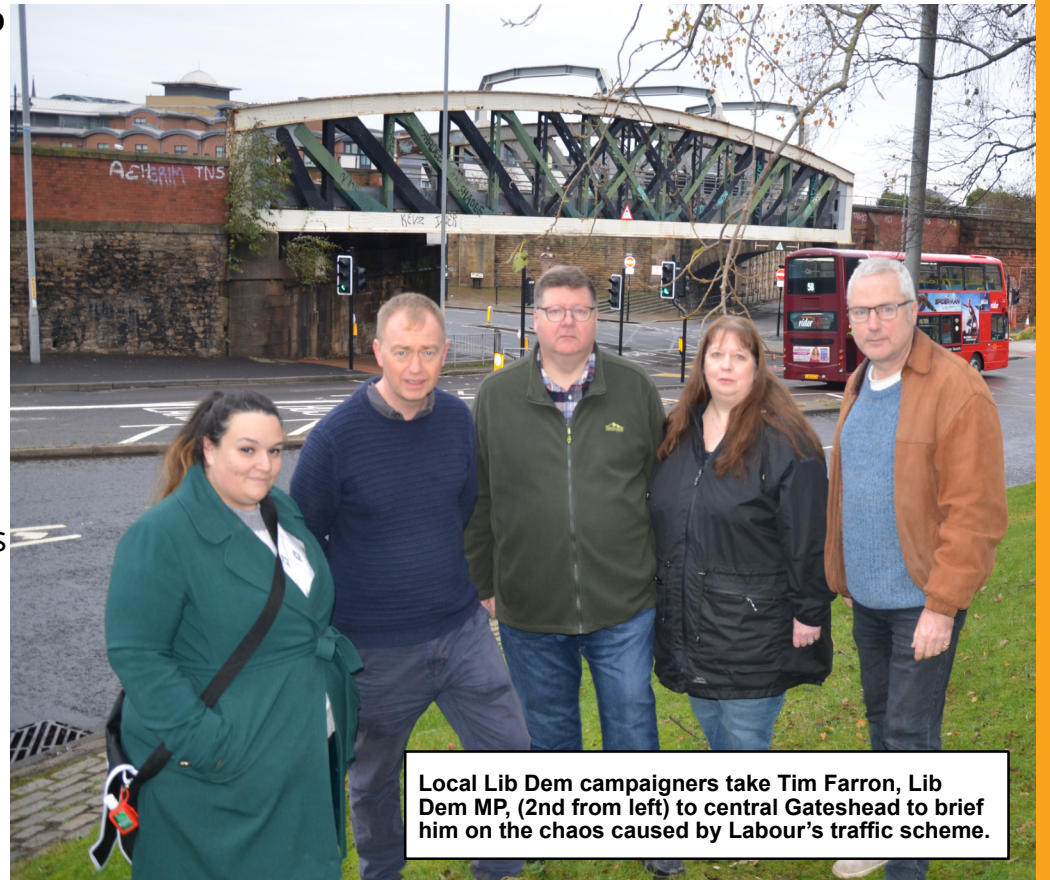
Local Lib Dem campaigners take Tim Farron, Lib Dem MP, (2nd from left) to central Gateshead to brief him on the chaos caused by Labour's traffic scheme.

"Gateshead's transport trap can be solved by scrapping the traffic management plan. They should go back to the drawing board and come up with something better."