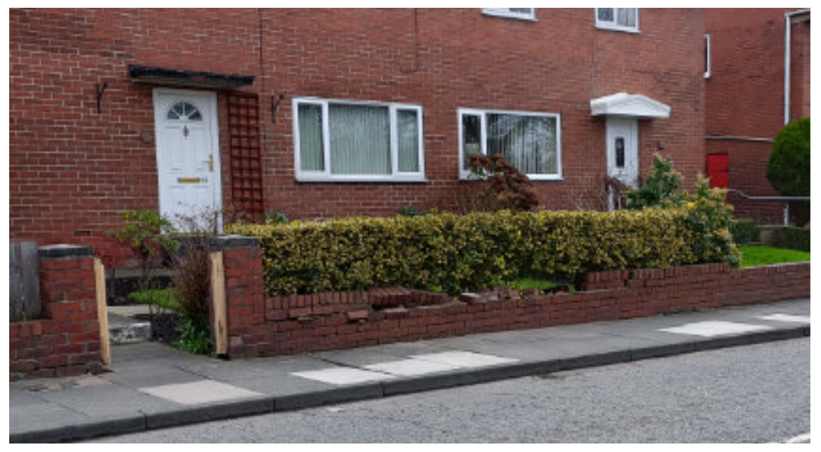
One of the parked cars that was hit by a speeding driver and a damaged garden wall on Gosforth Terrace