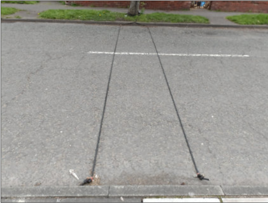
Monitoring equipment on Gosforth Terrace