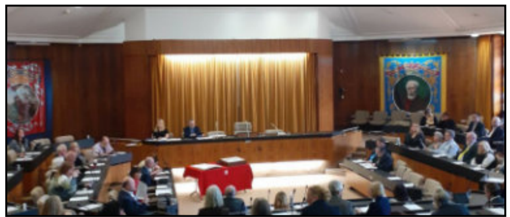
Too many Councillors: Lib Dems are calling for a cut in the number of Gateshead Councillors

The Local Government Boundary Commission England wants to hear residents' views on the size of Gateshead Council. A public consultation is taking place until July 10th. Your views are key to the outcome, so please do respond and make your thoughts known!