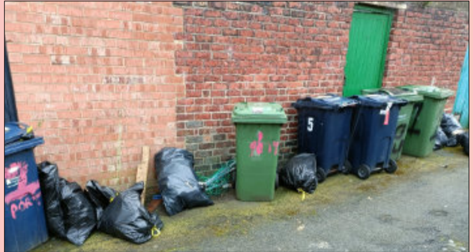
A small selection of the fly-tipping left behind Pelaw high street