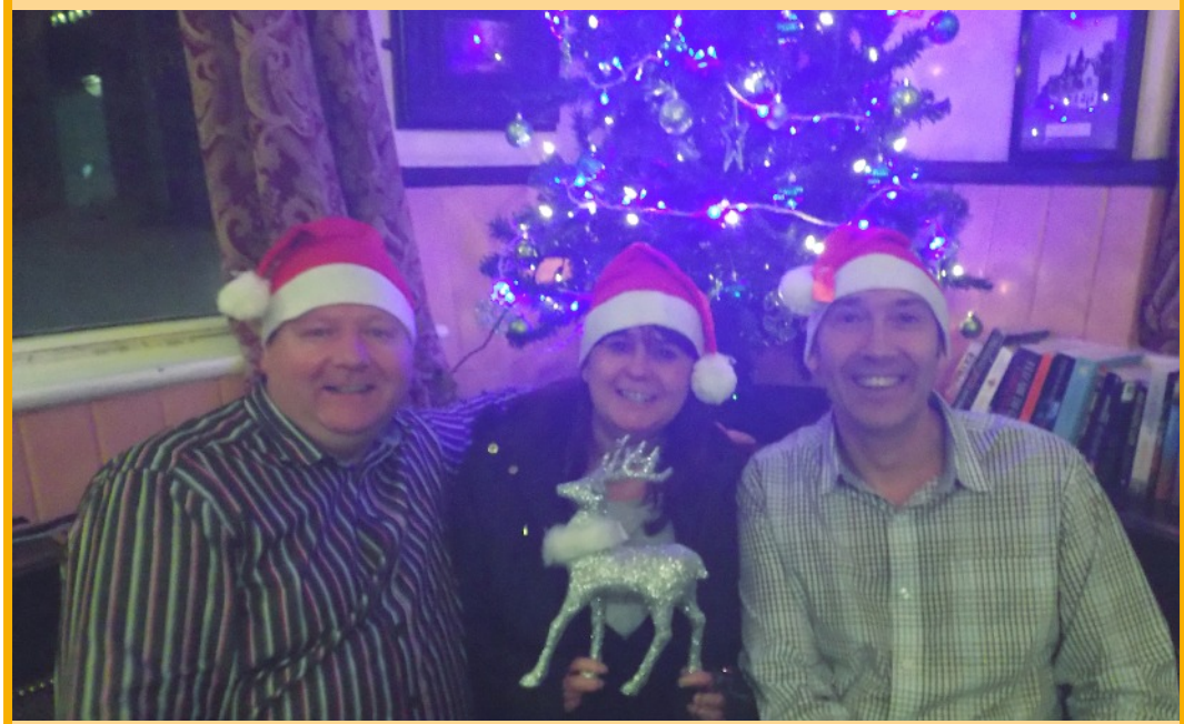
The Whickham North Focus team hopes that you had a great Christmas and New Year break.

We have been busy this Christmas and all year round helping our residents to prepare for and enjoy the celebrations.