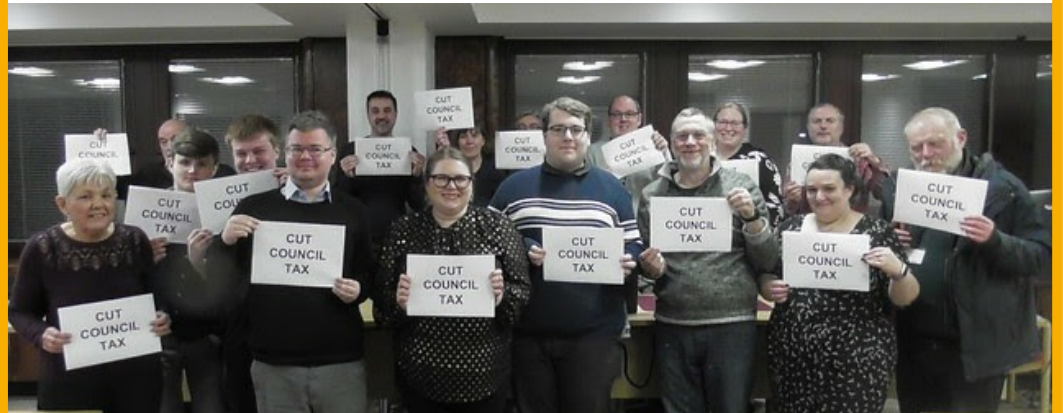
Lib Dems have launched a petition calling on the Council to Cut Council Tax

Lib Dems have launched an online petition to call for the Council to cut council tax. Contact us via jonathanwallace329@gmail.com and we will give the link to where you can sign the petition.