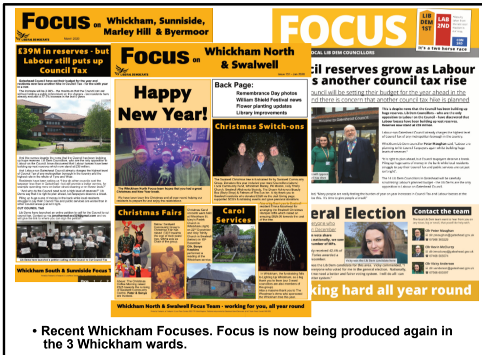
Recent Whickham Focuses. Focus is now being produced again in the 3 Whickham wards.

Along with everyone else we've been in lockdown and as a result our usual newsletter service to residents has been on hold.