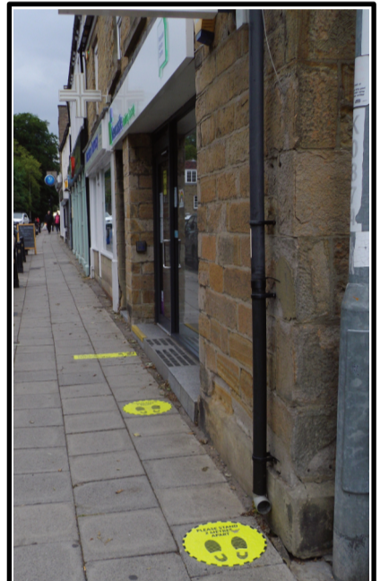
Shopping in Whickham with social distancing.