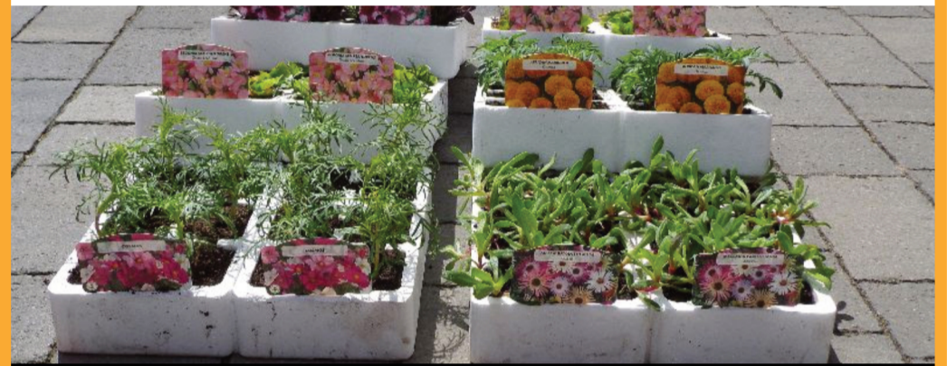
Garden centres are open again but local shops also sell plants for our gardens

While the big grocery chains are well placed to get through the lock down (and in some cases are benefiting from increased sales as households spend less on eating out) small businesses often don't have the reserves available to national retailers.