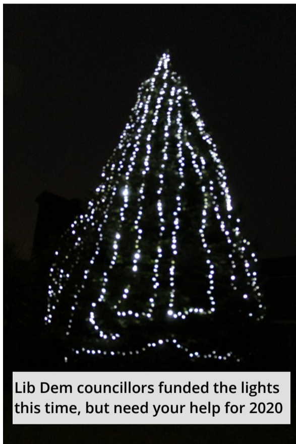
Lib Dem councillors funded the lights this time, but need your help for 2020

Lib Dem councillors agreed to meet the cost of the Christmas lights for 2019, but we need your help to do this again in future